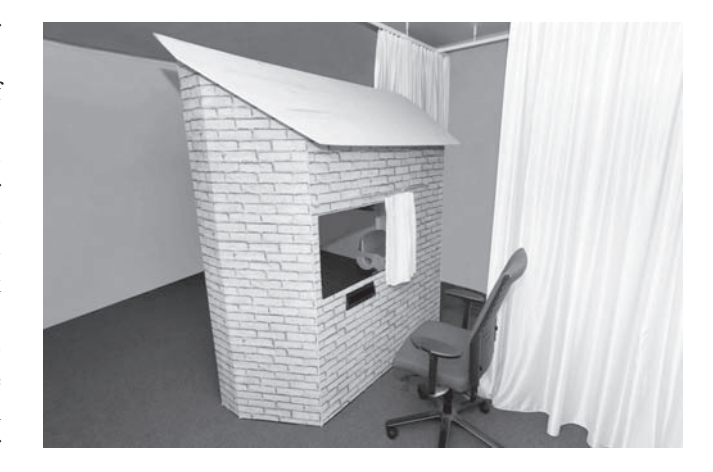
Fig. 1. House apparatus. While infants viewed video stimuli on a monitor placed in the window, their eyes were tracked by an eye tracker through a slit below the window.

The stimuli were shown at a monitor resolution of 1920 \times 1080 pixels in the following order: an attention-grabbing animation (4 s), a gray screen (3 s), and an action stimulus showing an adult performing either an introductory action (21 s; introductory trial) or one of two test actions (33 s each; test trials). In the introductory trial, the action stimulus showed the adult playing a game without needing help. In the test trials, one of the two actions portrayed him stacking cans to form a tower. After 28 s, the adult dropped the last can on the ground, pretending the drop was accidental. In the other test trial, the