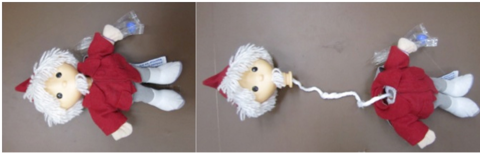
Fig. 1. Photographs of the doll intact (left) and broken (right).